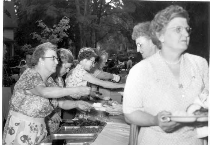
Serving up Chester foods 1950s-style.

Chester was an interesting mix in the mid 20th century, a collection of old and ethnic families that, united, survived the Depression and a war. Food was a part of that and by the 1950s the good cooks were hardly a secret. It is fair to declare - the mention of a name was often followed by the image of some kind of foodstuff.