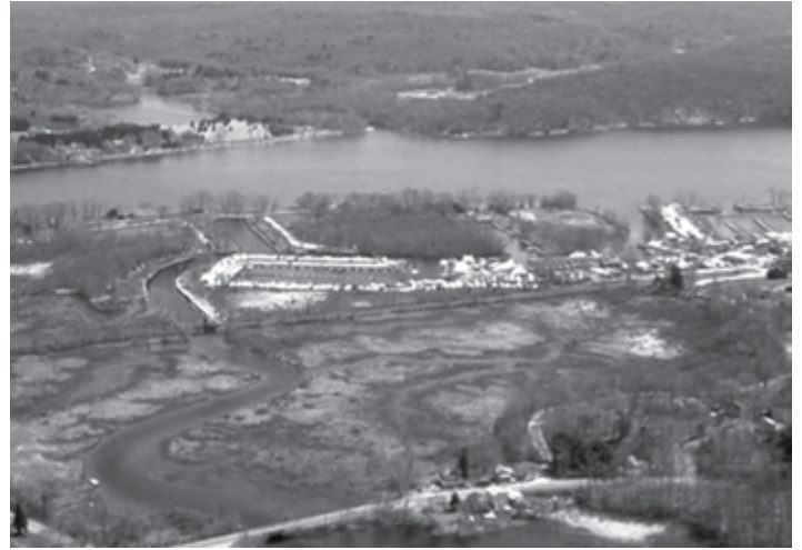
Chester Creek flows to the Connecticut River at Chester (Middlesex Avenue in foreground).

A new factor influencing our evaluations of our waterfront areas is visual impact. Under new State guidelines, visual impact plays a key role in our, and the State DEEP, evaluation of waterfront development applications.