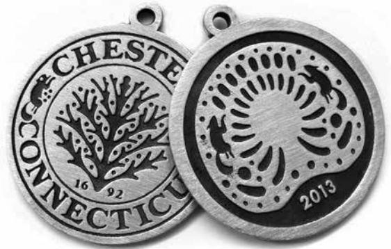
The new Chester pewter ornament will be sold through the Chester Merchants at most the shops in town.

Who can object to winter when it's celebrated with awesome ice carvings, a chili-tasting contest, and a decorated tractor parade? Throw in some Mardi Gras-style beads, face painting, and street performers, and you'll never hate winter again!