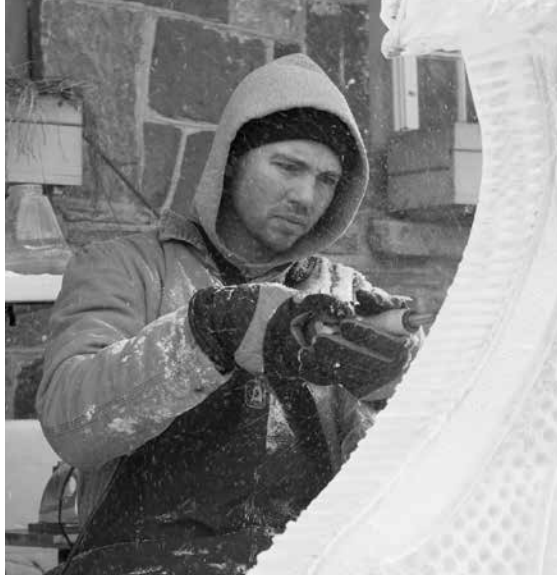
Enjoy watching ice carvers at work at the 24th Annual Winter Carnivale on Sunday, February 16.